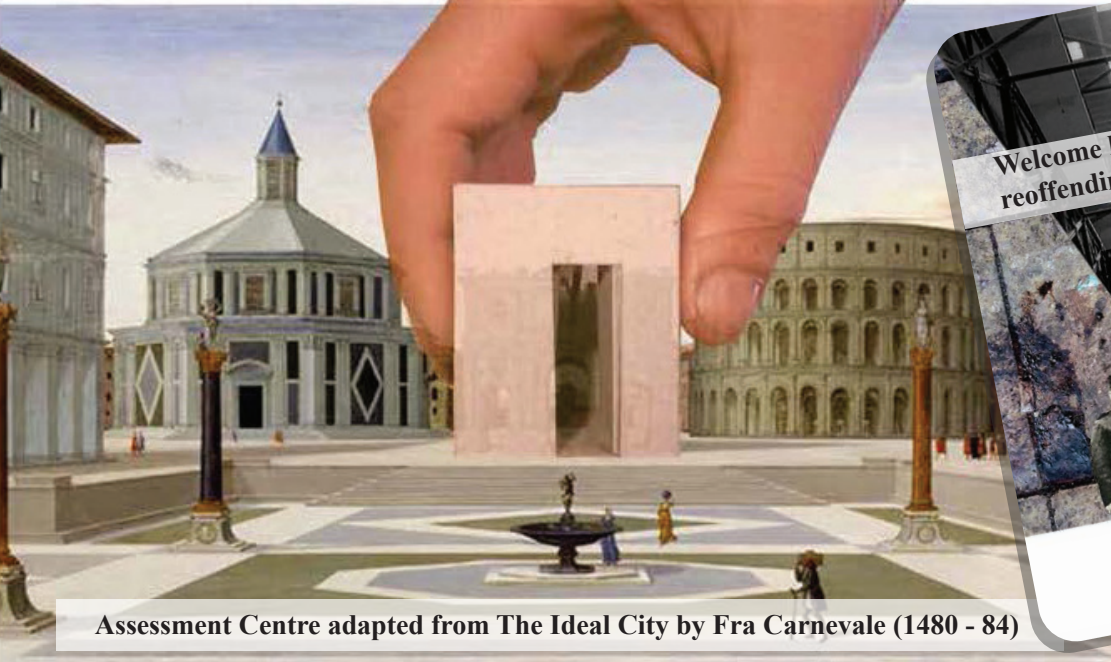
Assessment Centre adapted from The Ideal City by Fra Carnevale (1480 - 84)