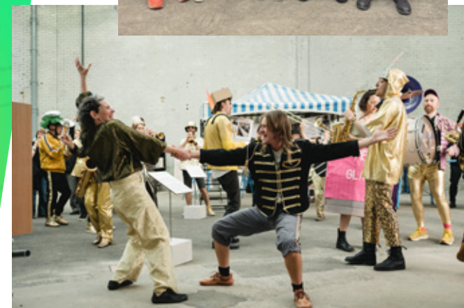
Images: A selection of images from the 2025 Architecture Fringe Festival | Reciprocity - Architectures of Exchange